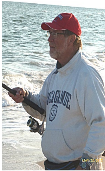
Gard is on vacation.