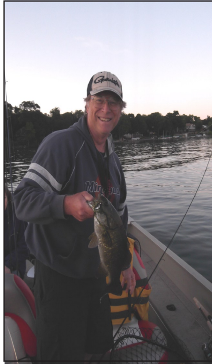
Gard on Mendota 2012