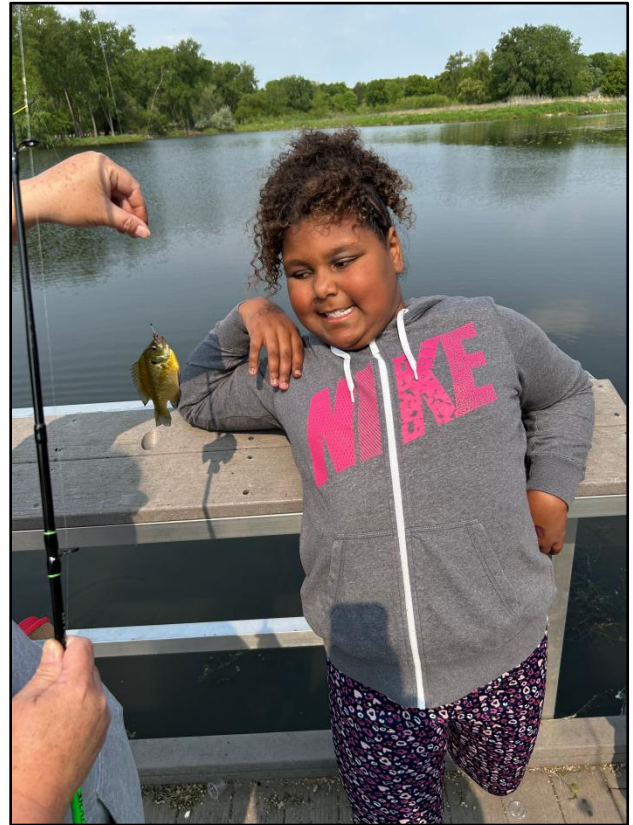
The kids always remind us that it's great to catch a fish, no matter what the size!