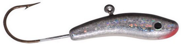
The now famous slick jig