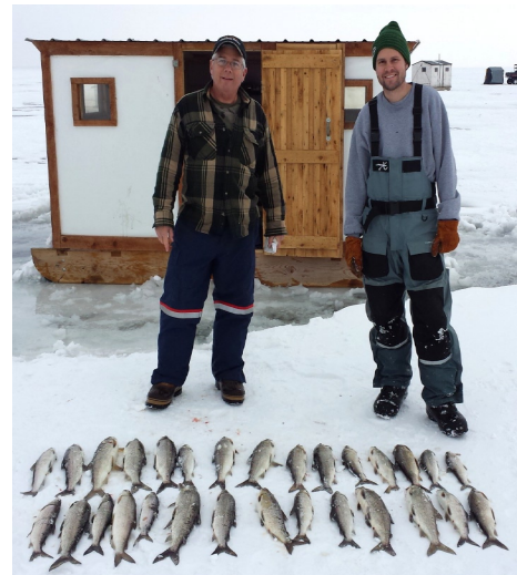
Lots of Whitefish