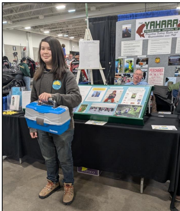
Sunday's winner of a tackle box