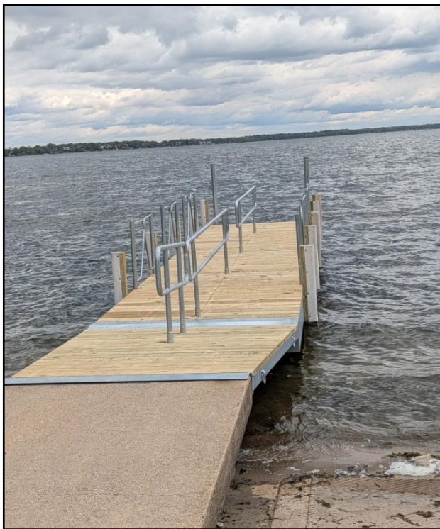
New dock installed at the Olin Park boat launch