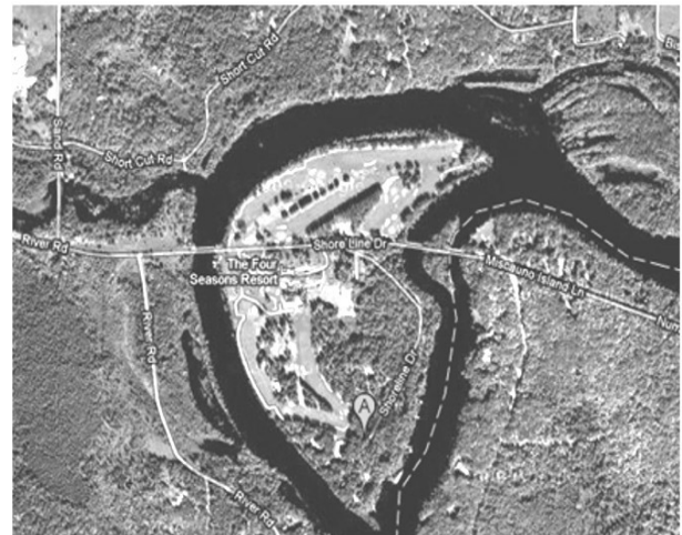
Miscauno Island in the middle of the river

We launched out of a township landing on Short Cut Rd. near a place called the Four Seasons Island Resort. As we came out of the landing in a backwater and headed to the river we got a view of the resort, golf course and the island it is on. Our plan for the day was to head downstream to fish the reservoir. We started out throwing 4" Senkos at trees and other obstructions in the water on the shady shore. Things started slow but eventually we started getting hits and boating a few small to medium sized smallmouth. Eventually we reached the dam and worked over the rip rapped face. Senkos again produced the best with lots of small fish running 10-12".