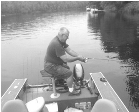
Uncle Al's first fish of the day

We were actually staying at my uncle's cabin down in Mountain so on Saturday we loaded him in the truck and headed back up to the river. It was a little cooler and this time we didn't spend any time heading down stream. We started in the river and stayed there for the remainder of the time we fished Senkos were again a very good producer but Mitch also got some fish on Skitt Pops and Rebel Pop Rs. We worked our way up stream fishing the rocks, logs, docks and stuff that diverted the current in the river. Our journey up stream was cut short by some thunder, lightning and a hard cold rain but since we were in the river with lots of things to hit the lower unit we couldn't get back to the landing very fast.